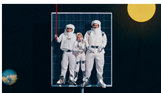
A journey through Swiss Life Group

Swiss Life Holding Ltd, registered in Zurich, was founded in 1857 as Schweizerische Rentenanstalt. The shares of Swiss Life Holding Ltd are listed on the SIX Swiss Exchange (SLHN). The two subsidiaries Livit and Corpus Sireo are also part of the Swiss Life Group. The Group employs a workforce of around 7600 and approximately 4600 certified financial advisors.